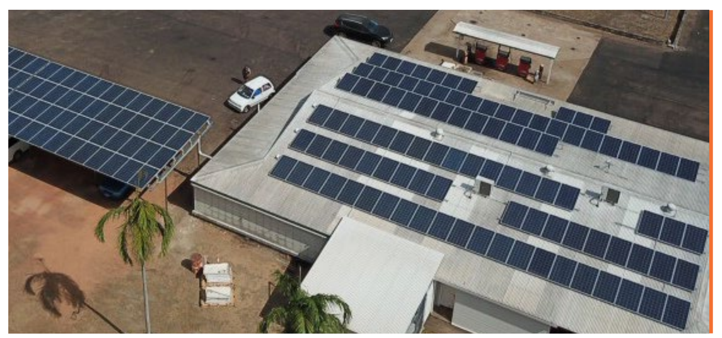
Darwin River City Tavern - 180kW Solar & LED Lighting Upgrade