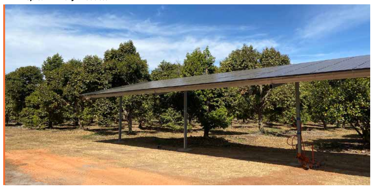
Tropical Primary Products - 47.1kW