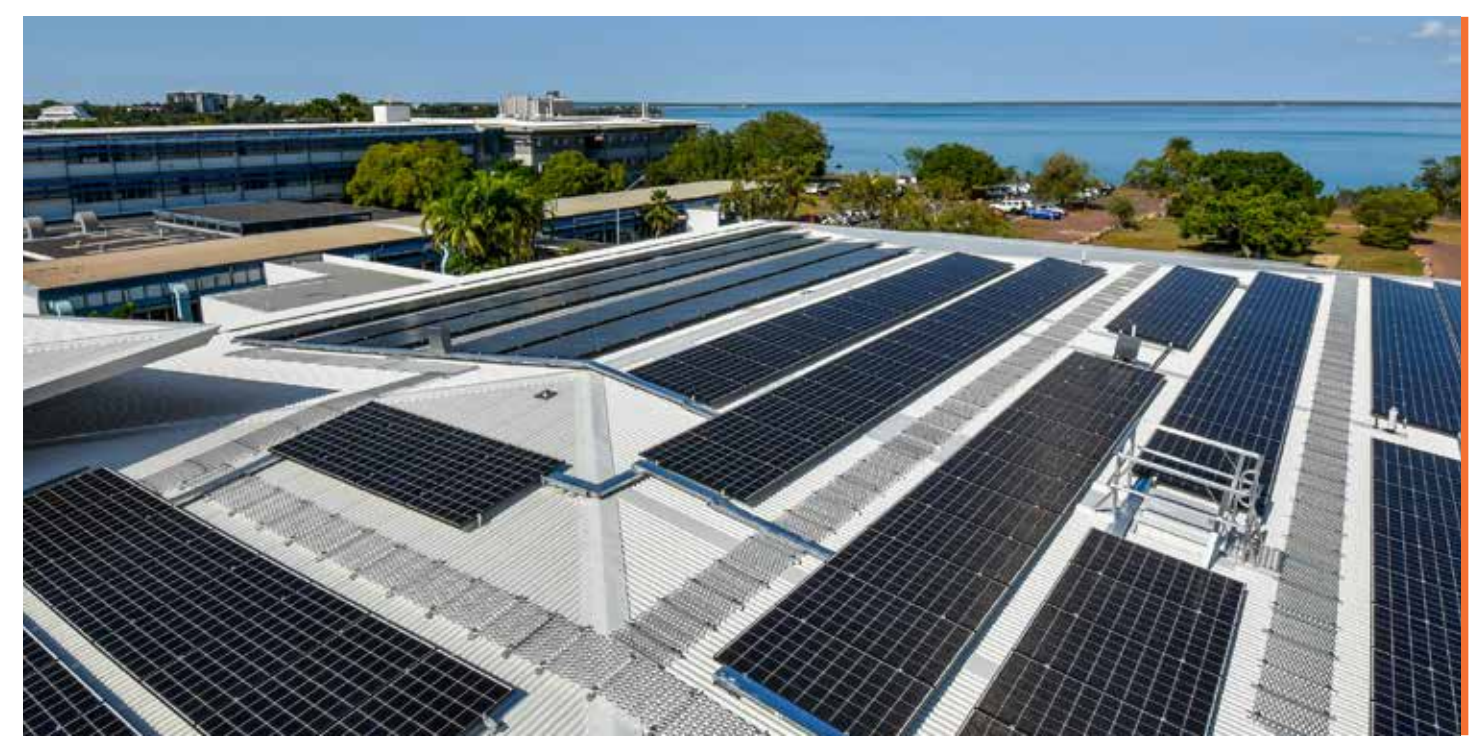
Darwin High School - 99.75kW