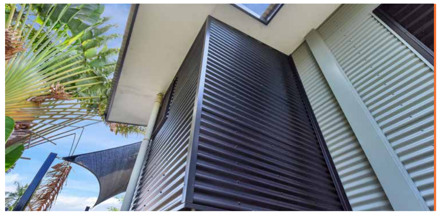
Wagaman Terrace - Re-roofing, wall-cladding, solar & battery