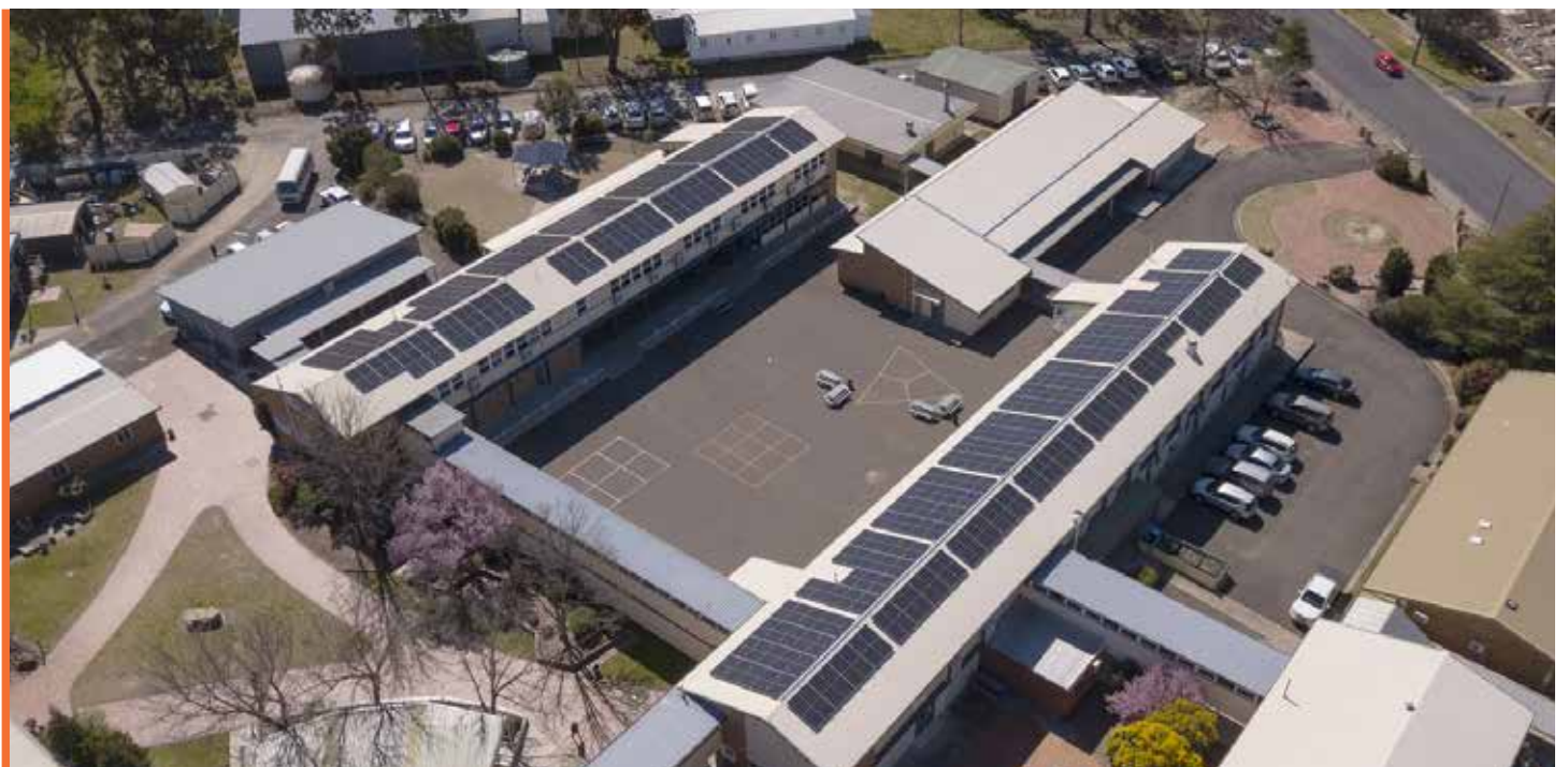
Stanthorpe State High School

Worked alongside Downer to install solar on numerous schools across the Darling Downs region of South-East Queensland.