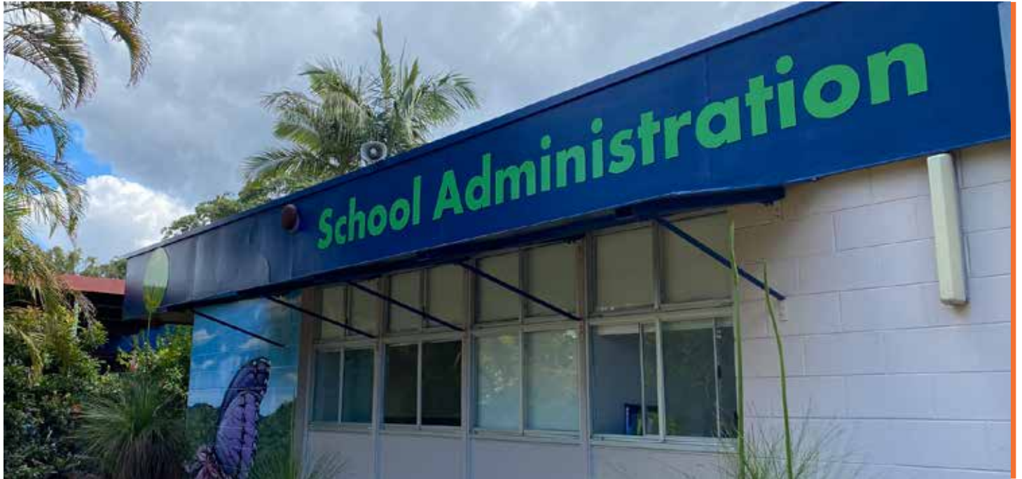
Coolnwynpin State School