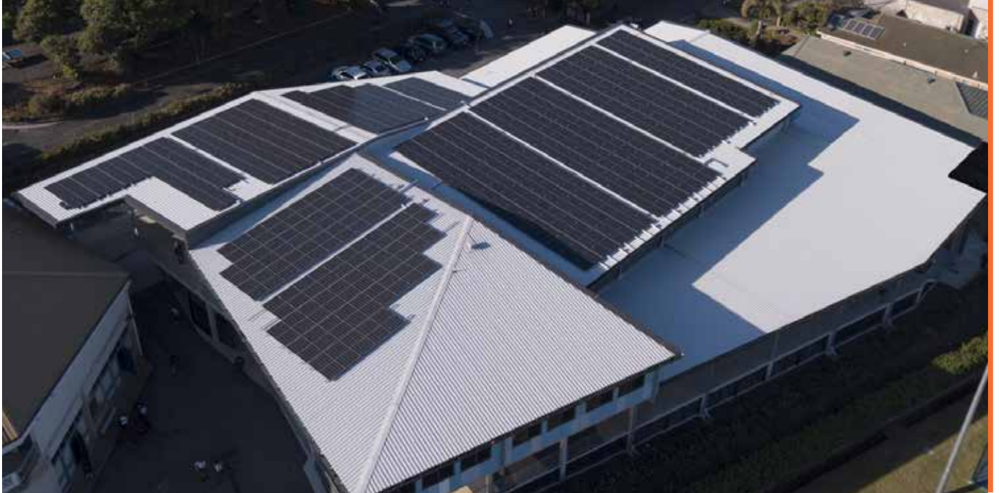
Wavell State High School