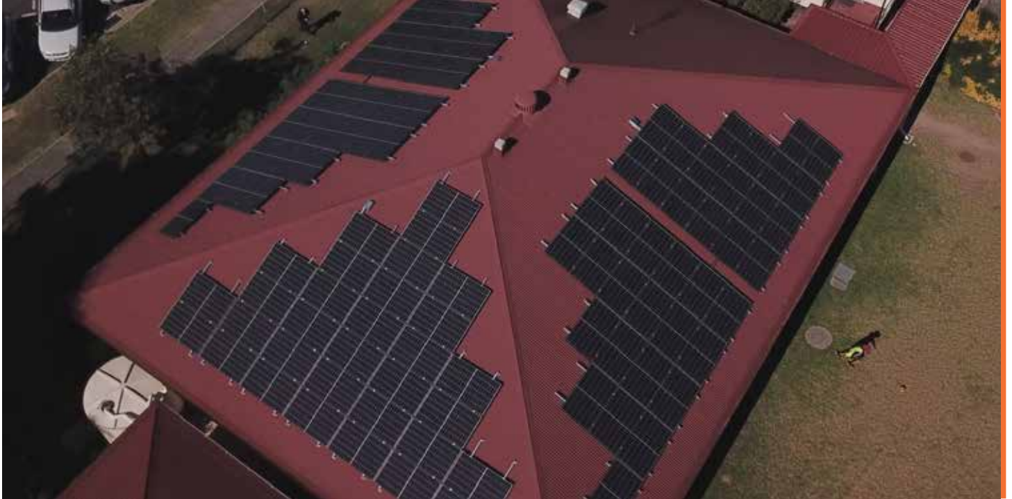
Warwick Central State School