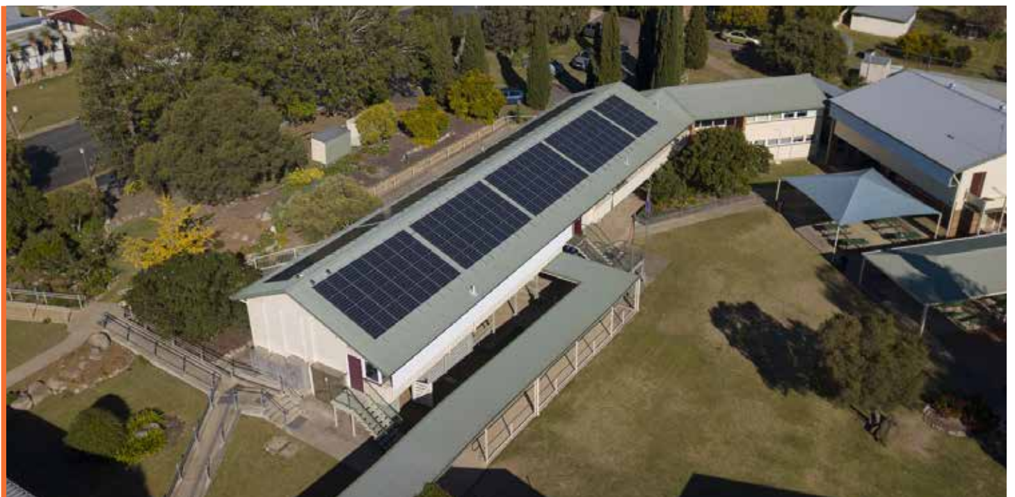
Glennie Heights State School

Worked alongside Downer to install solar on numerous schools across the Darling Downs region of South-East Queensland.