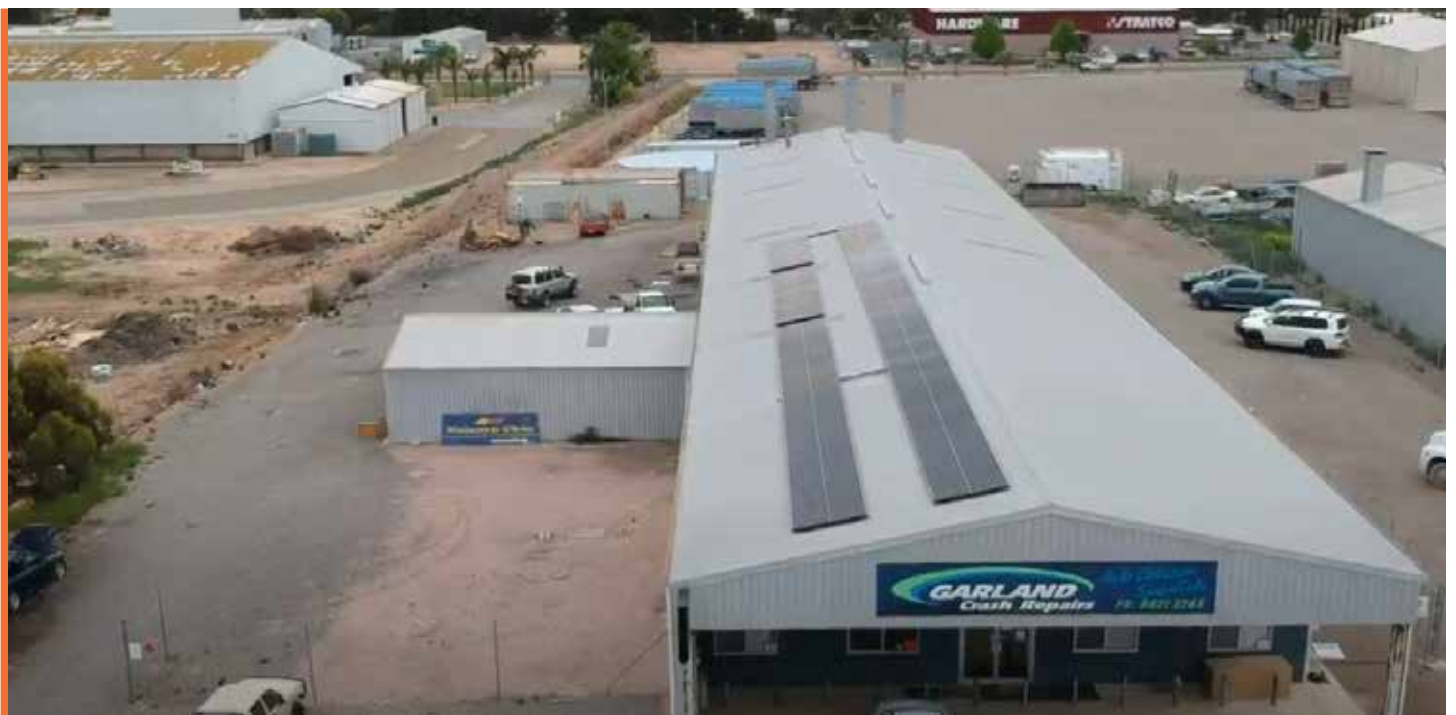
Garland Crash Repairs