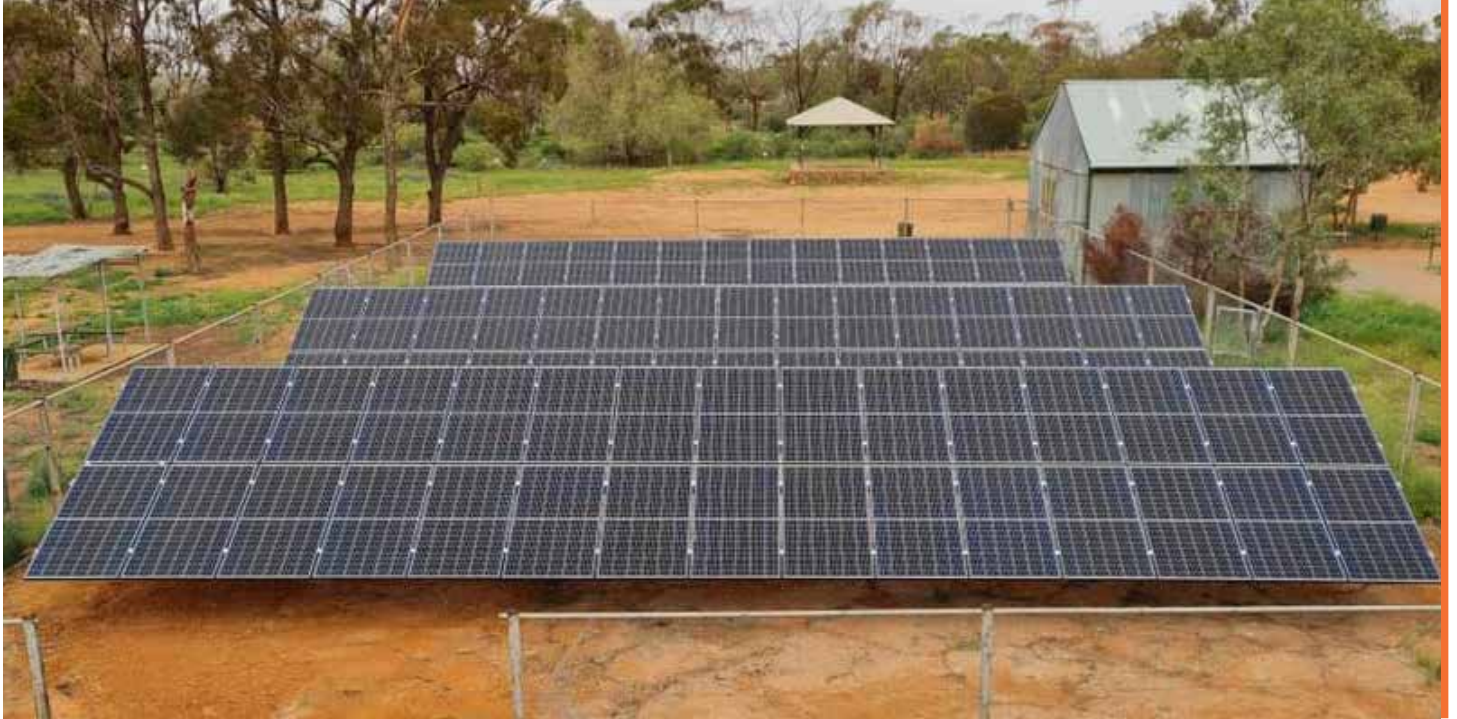
Penrose Park Ground Mount